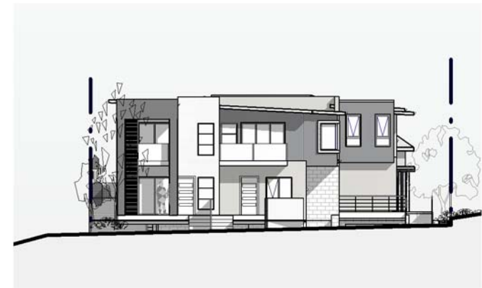
2 NP- FRONT ELEVATION NP 1/1 1 : 300