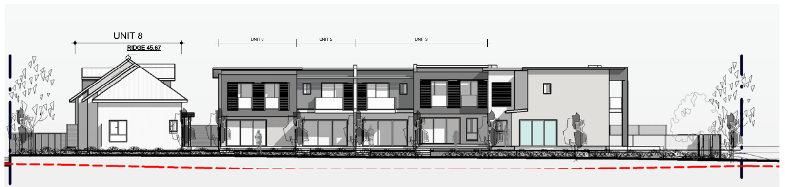
5 NP- SIDE ELEVATION- W NP 1/1 1 : 300