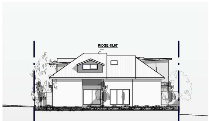
3 NP- REAR ELEVATION NP 1/1 1 : 300